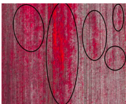
High Weed Pressure